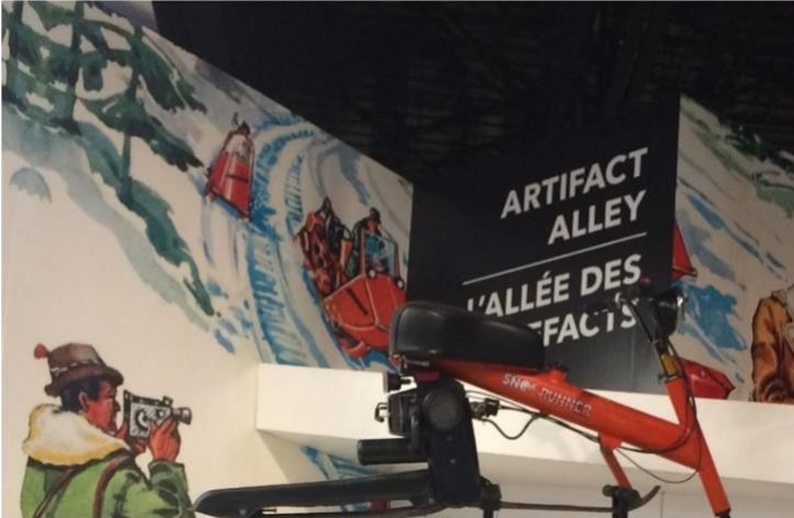
Exhibit – Artifact Alley – Winter

Which season do you think is represented by this display? How can you tell?