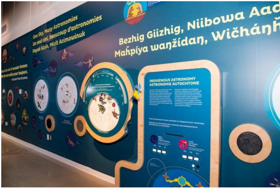
Exhibit – Hidden Worlds – One Sky, Many Astronomies

Find the big star wheel. What images can you see in the sky?