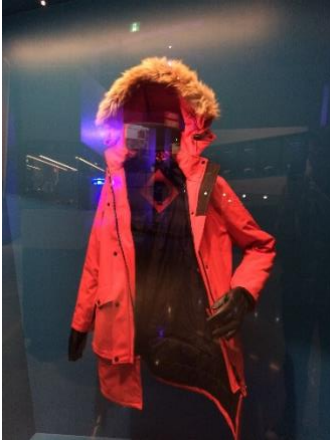
Exhibit – Wearable Tech – Connect Yourself

Find a piece of wearable technology designed to help us in winter. How do you think it works?