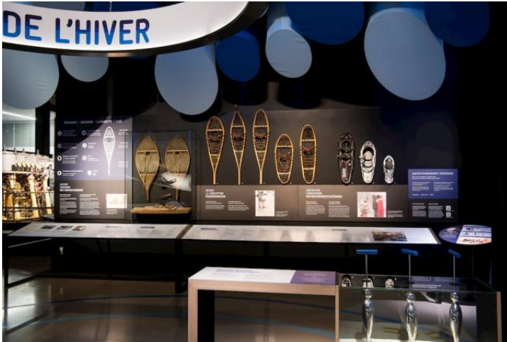
Exhibit – Into the Great Outdoors

Find an activity that usually cannot be done in the winter. Why do you think we can't do it all year round?